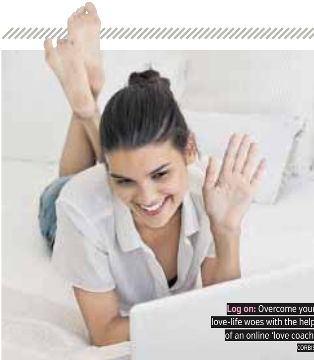
Log on: Overcome your love-life woes with the help of an online 'love coach'